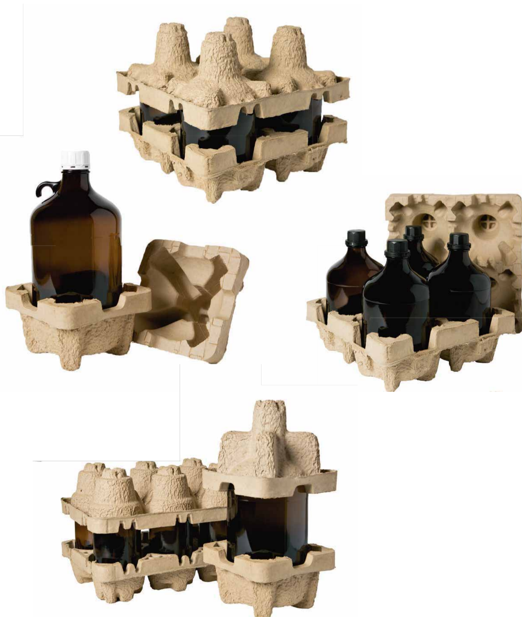
Material: 100% recovered paper and cardboard